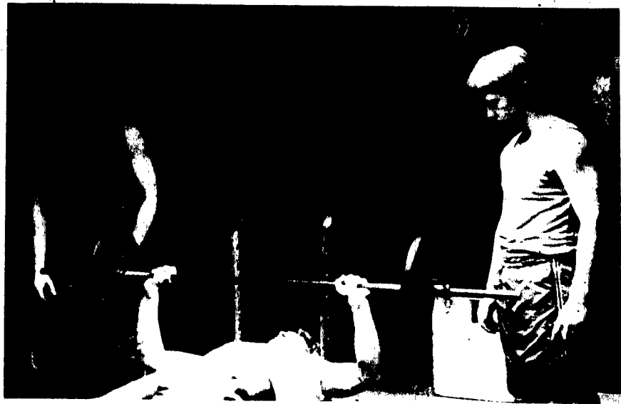
Preparing For the Spotlight Lift

ONE OF the keys to the successful Winside wrestling program has been the weight training.